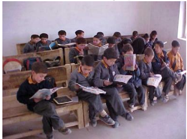
Star's Land's Students in the class room

Previously, when there was a monopoly of the government in Educations sector, till late 1980s, the students did not have a friendly environment in the schools as the teaching staff had their own autocratic style of teaching and students did never have independence of expression. In that traditional culture of education, the students were not allowed to ask even a single question in the classroom but they had to pass the examination through memorizing the lessons by heart and there was no room for creativity of the students themselves. With growing education market all over Pakistan in general and in Chitral in particular through the private sector, the young boys and girls of the area have been provided with open options and choices of different schools. The increasing number of private/community owned schools influenced the government policy and the culture of even the government school has now changed from teacher centered education to students centered education system. Thus, it can be rightly said that now there is a perfect competition in the education market in Chitral where quality of a product matters a lot and Star's Land Grammar School has been successful in making its goodwill in terms of quality education, friendly environment to the students and comparatively low cost to the parents for better quality education.