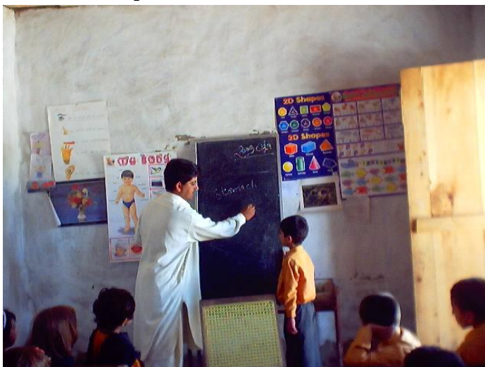
A student in a classroom answering the teacher

As being a modern English medium private educational institution, Star's Land Grammar School, has provided a highly conducive environment to its students where they are encouraged to demonstrate their hidden potentials and creativities in different ways and means. For, example, the students make portrait of different national heroes, national and international personalities and do different thematic paintings and the products are displayed on the walls of their respective classrooms. The displayed charts are replaced with the new work by some other students after one or two weeks, depending on the availability of the new products.