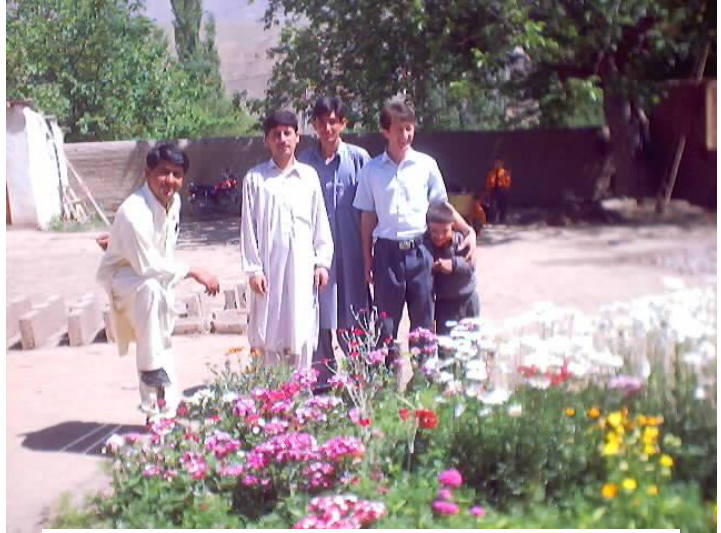
Teaching staff in the School's Lawn

To enhance the capacities of the teachers and give them further skills in modern teaching techniques, the teaching staff members are given regular trainings by the head teacher in the school. They are also sent to the various schools in the area to learn good practices in teaching and develop creative learning environment for the students. In addition, the Professional Development Center (PDC) of the Aga Kan University has started functioning in Chitral. The PDC Chitral provides training to the teachers of various schools in the district. Star's Land School has also developed linkages with the PDC and there has been an agreement that the PDC will provide professional training to the teaching staff of the school. In this connection, PDC has trained one teacher from the school in English Teaching, during 2003 and will also provide training to the rest of the staff members in other relevant disciplines in the coming years.