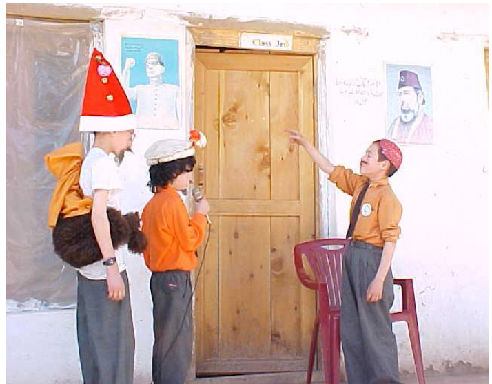
Students performing in a stage show held in the school

The school has been providing their students with opportunities of competition with the students of other schools in sports, peaches and story/essay writings held by different development organizations working in the area.