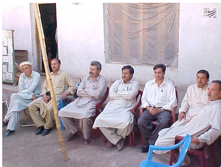
Community members in an Annual Function of the School

As participation of all the key stakeholders in any project or program is fundamental to ensure proper implementation, smooth functioning and sustainability in the long run, Star's Land School