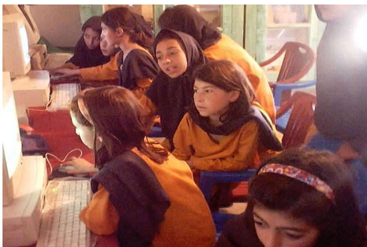
Students of SLGL in the Computer Laboratory