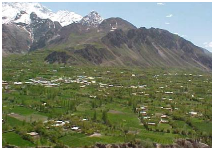
A view of village Booni and the picnic spot "Shipishun"

Star's Land School does not only provide better modern educational facilities to its students but also organize different types trips and events for recreation and entertainment of the students. One