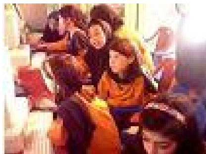
IT class at SLGS

We have a computer lab, and the children are introduced to computers in the class 4th and continue to use them over the years.