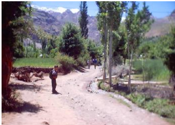
Outskirts of the stars'land grammar school

The school has been established in a peaceful environment surrounded by dense and shady trees and green fields .It situates at the heart of village booni. Clean stream water goes down through the channels around the School. the School is being situated at the center of booni village is very accessible.the students also enjoy going to the farms for the purpose of their research work. It is a new experience to take children out side the school ,and let them do study of the nature,which is very special to the area.