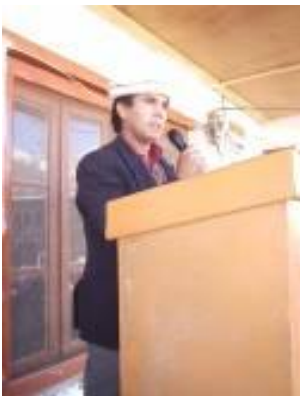
Chief quardinator of PDCC ( parents day 2004 )

To make the environment accessible for the children in the stars' land Grammar school teachers sit together every week end and discuss issues for two hours. Apart of that teachers are provided professional training by PDC Chitral. It is a center that has been opened in Chitral for three years. the objective of PDC is professional training to the teaching staff of various educational institutions in the are regardless any difference, developing curriculum, providing teaching materials and providing management guidance to their schools in the districts. These training's are directly monitored from IED Karachi through Internet services. Stars' land Grammar School has constantly benefits from the courses of the PDC Chitral. They have provided